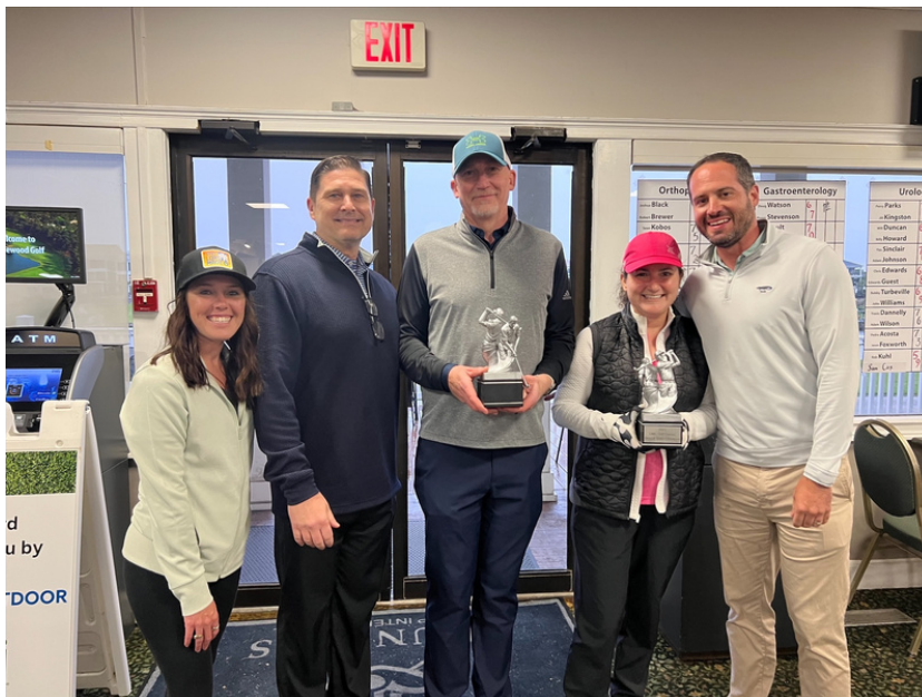
2023 Golf Classic Winners

To date, the CMC Golf Classic has raised over 1.7 million dollars in support of the CMC Foundation's Health Outreach initiatives.